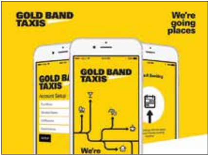
Gold Band Taxis Brand | Website | Design | Apps