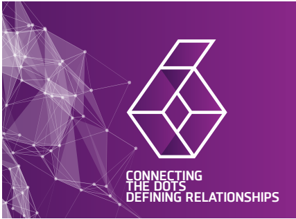
Section 6 Brand | Design