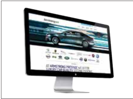
Armstrong Motor Group Website | Digital Design