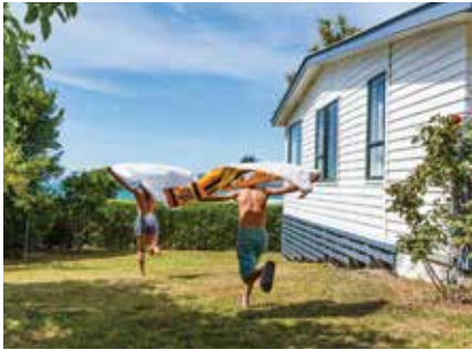
Bayleys Design | Campaign