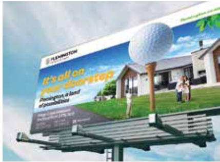
Flemington Brand | Website | Campaign