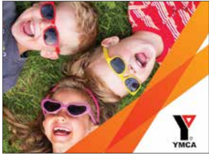
YMCA Website | Design