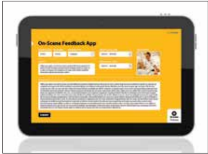
St John Ambulance Digital Design | Apps