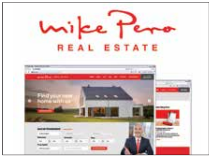
Mike Pero Real Estate Design | Website | Apps