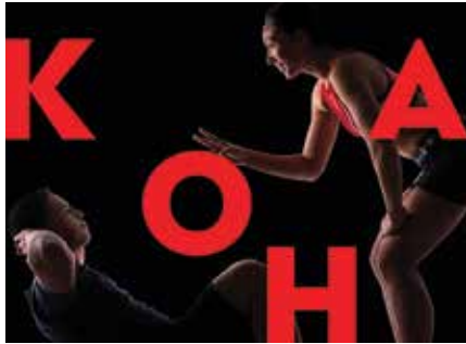
Koha Fitness Brand | Website | Design