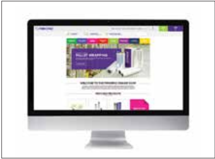
Primepac Ecommerce | Design