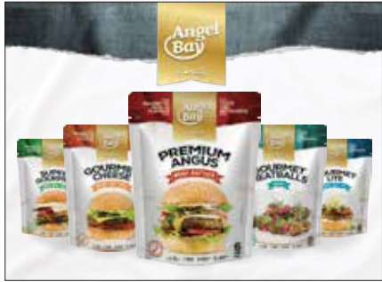
ANZCO Brand | Packaging Design | TVC