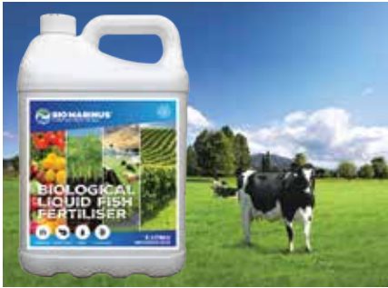
United Fisheries Brand | Design | Website