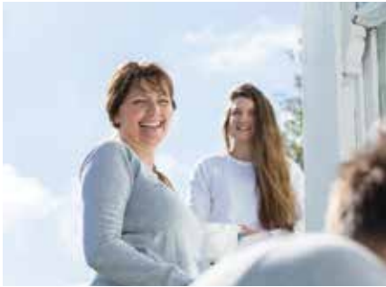
New Zealand Home Loans Design | Website | Campaign | TVC