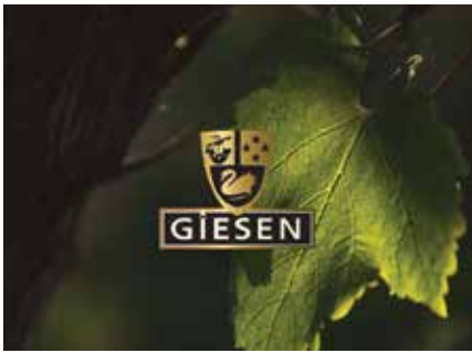
Giesen Wines Design | Website | Apps