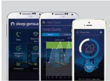
Sleep Genius Website | Design | Apps