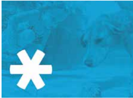
OssAbility Brand | Website | Design