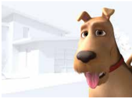
Warner Fencing Design | Website | Apps | TVC